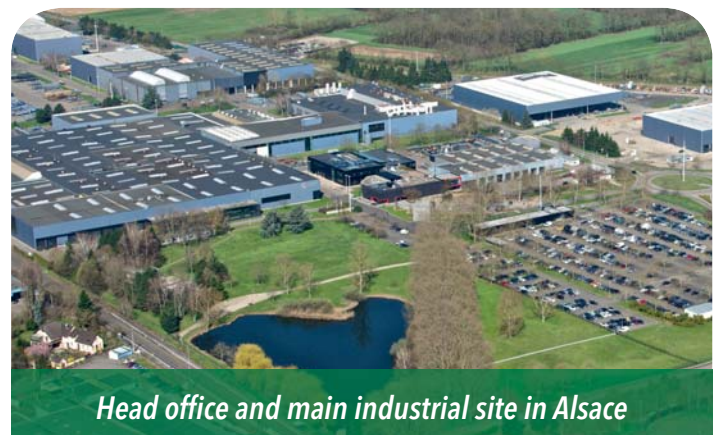
Head office and main industrial site in Alsace

Tél. : +33 (0)3 88 48 53 00 / +33 (0)6 45 98 08 82