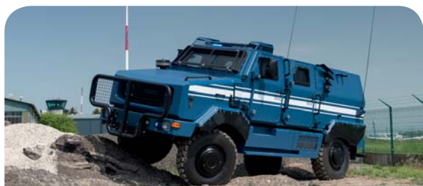
MPGV, Multi Purpose Gendarmerie Vehicle

The MPGV is a high-mobility 13-tonne 4x4 armoured vehicle designed for security operations and maintaining peace and order. It is designed to deploy intervention teams in hostile situations and it can transport up to 10 people depending on the version required.